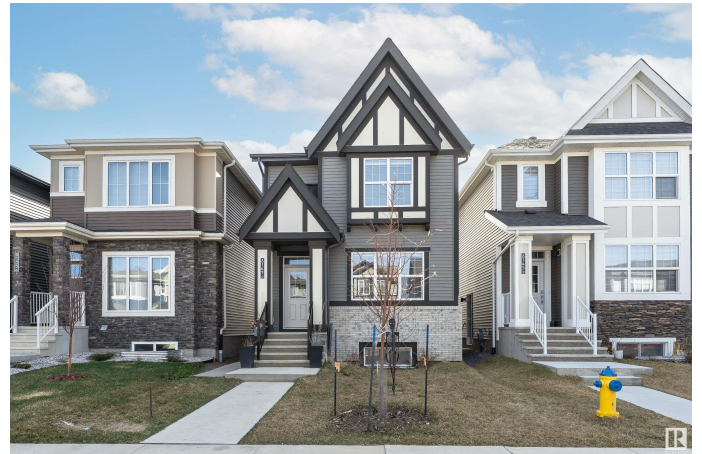
8149 226A St NW, Edmonton, AB

Main Floor Exterior Area 82.24 m 2 Interior Area 75.99 m 2